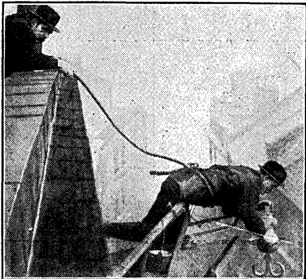
Leaning Down Over London —The men who work on and about the tall buildings in London have many exciting moments, and here we see a painter at work in an awkward position on a big crane