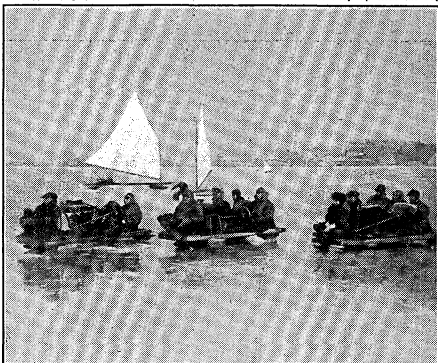
Motor Sleights Line Up for a Race —Driven by motor-cycle engines, these sleights can travel at a great speed on the ice, and here they are just lining up for a race across a frozen lake in New Jersey. Races of this kind are very popular just now in America and Canada