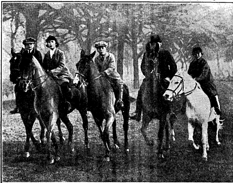
An Early Morning Ride in the Park —Horse-riding has always been a very popular recreation in England, and here we see a merry party of boys and girls, in charge of their riding-master, out for a canter in Hyde Park. This is the great meeting-place for riders in London, and well-known people may always be seen cantering up and down in Rotten Row