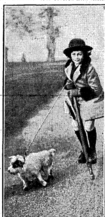
Off for a Run —Here is a new way of taking a dog for a run, but the terrier's little mistress on the pogo stick has hard work to keep up with the dog