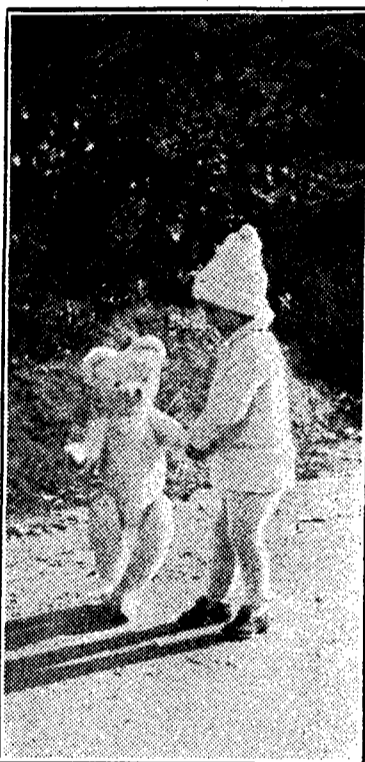
Teddy Goes for a Walk —A little Australian reader of the C.N. takes her big Teddy bear out with her and tries to teach it to walk