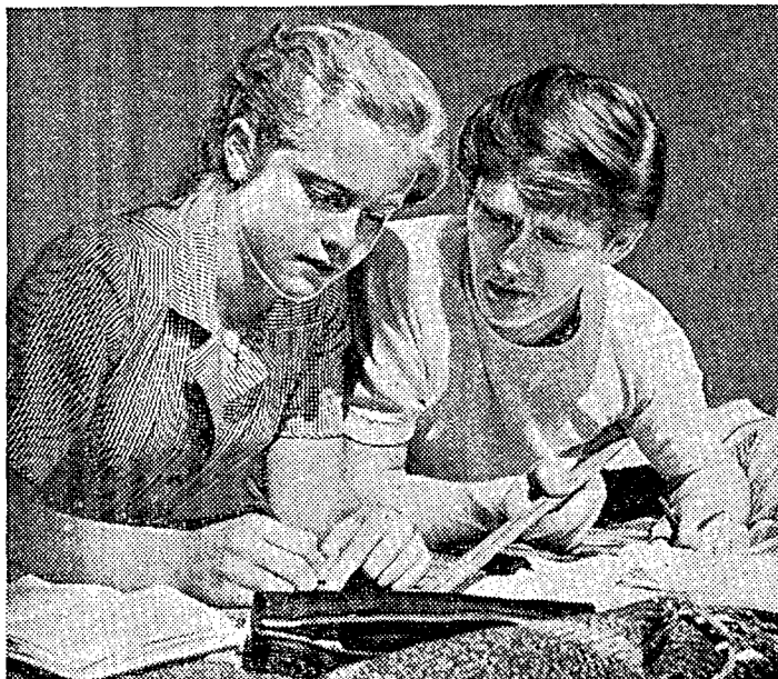
Ginger (John Leyton) helps his sister Sarah with her homework

His father says he is so quiet at home that one might sometimes think he was out. This is because he spends a great deal of time answering stacks of fan letters.