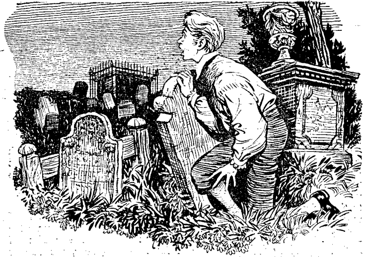
He crouched there behind a gravestone, unable to move or utter a cry.

It was his sister, half-dressed, like himself, and her hair just as wild.