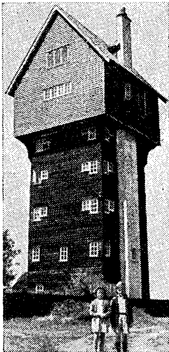
This strange dwelling facing the sea at Thorpeness, Suffolk, is known locally as the House in the Clouds.