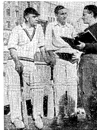
Cyril Washbrook (left) and Len Hutton being directed by Anthony Asquith while filming Terence Rattigan's 'The Final Test', at Pinewood Studios.

EVERY year the Sports Writers' Association selects the man they consider has done most to enhance Britain's sporting prestige. Their choice for 1952 is Len Hutton, the famous Yorkshire and England cricketer.