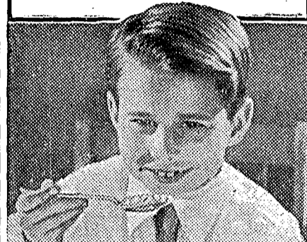
Young WILLIAM is insistent about his breakfast. It must be Puffed Wheat . . . those fat, golden brown grains, tempting to those lazy appetite. How he enjoys them . . . and what nourishment they provide.